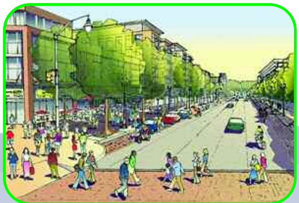
Hill East Waterfront