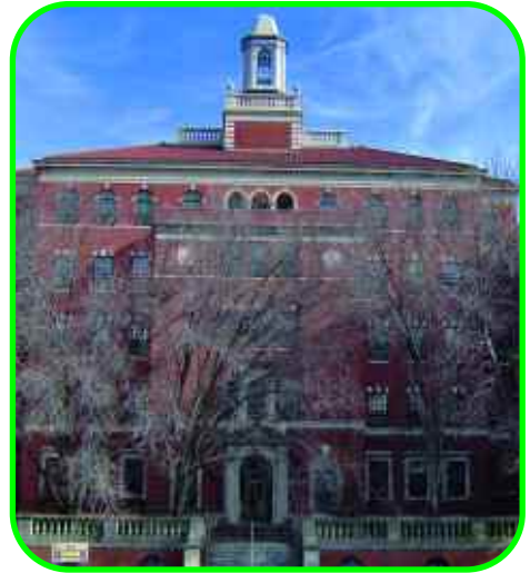
Saint Elizabeths Redevelopment

Location: Martin Luther King, Jr. Ave, SE November 2008 – Comprehensive redevelopment plan for St. Elizabeths East Campus submitted to the D.C. Council for approval For more information: www.planning.dc.gov