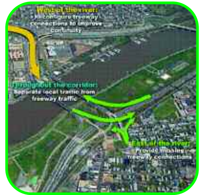
11th Street Bridges Replacement

Location: At the southeastern end of Capitol Hill Early 2009 – Selection of master developer For more information: www.dcbiz.dc.gov